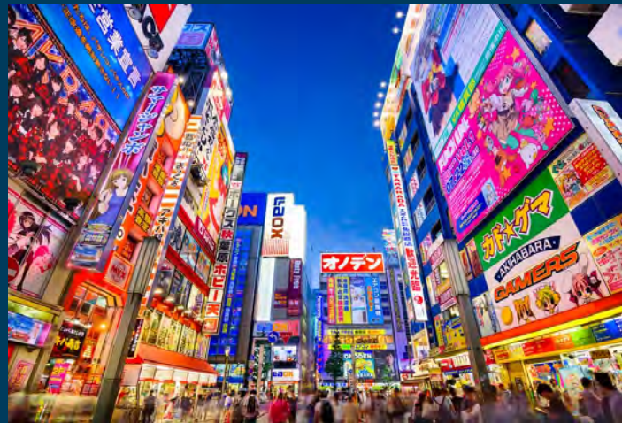
▲ Tokyo, Japan's busy capital, mixes the ultramodern and the traditional, from neon-lit skyscrapers to historic temples.

A: Tokyo. I am fascinated by the use of color, design, language, food, and culture.