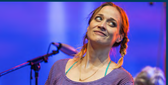
▲ Fiona Apple McAfee-Maggart is an American singer-songwriter and pianist. Classically trained on piano as a child, Apple began composing her own songs when she was eight years old.

A: I do not remember my first concert, but I have lovely memories of performances such as the skillful piano playing of Fiona Apple and an orchestra scoring the movie to Jurassic Park.