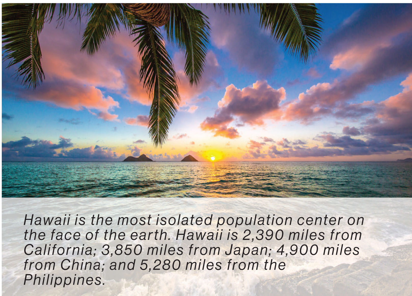
Hawaii is the most isolated population center on the face of the earth. Hawaii is 2,390 miles from California; 3,850 miles from Japan; 4,900 miles from China; and 5,280 miles from the Philippines.

What is the best advice that anyone has ever given you?